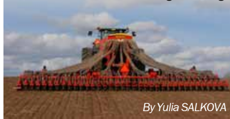
By Yulia SALKOVA

The seeder is fitted with various sections for treating the soils in accordance with their condition. The Spirit seeder is manufactured with various operating widths of 4, 6, 8 and 9 meters. The grain bin capacity is 3,740 litres on the 4 and 6 metre models, and 3,900 litres on 8 and 9 metre models. So it is possible to seed 15 to 30 hectares with a single bin filling.